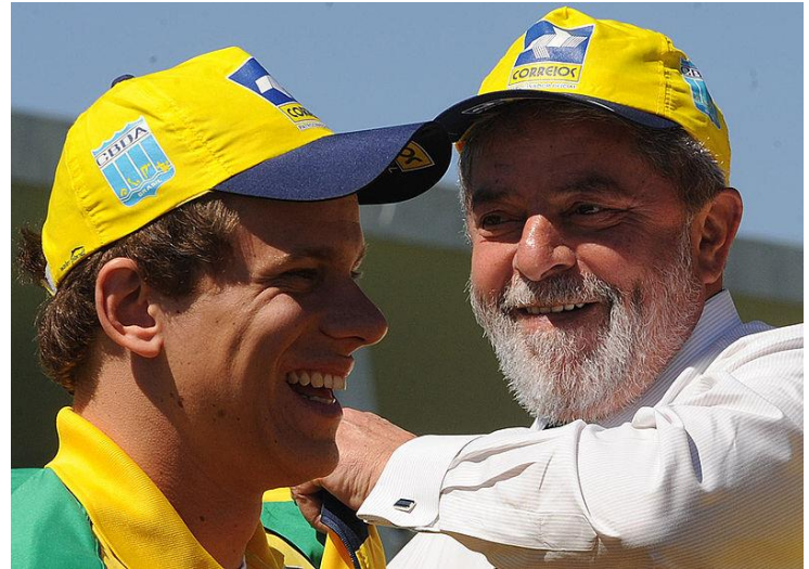
Lula wearing a Correios logo.

The previous Bolsonaro administration tried to privatize Correios, but never achieved its goal, according to The Rio Times .