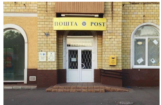
A post office in Ukraine, not far from the front lines.

Ukrposhta , Ukraine's postal service, announced that it has "resumed work in 390 liberated settlements in Kharkiv region." As Ukrainian forces push back Russian invaders, Ukrainian postal workers are now "issuing pensions, which local residents have not been able to receive for several months while they were under occupation" and resuming regular parcel delivery. The service is also delivering medicines to the formerly occupied territories.